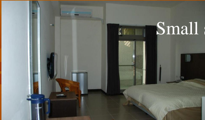
Small suite with a Bathroom *19